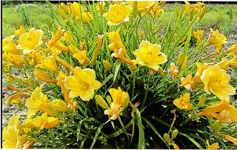
Spring in Argos